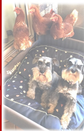
The Feast of St Francis